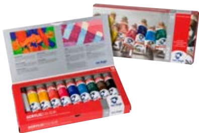
Cardboard set with 10 tubes 40 ml