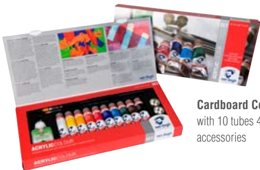
Cardboard Combi set with 10 tubes 40 ml and accessories