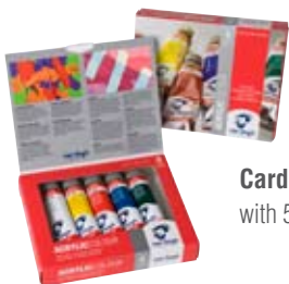
Cardboard set with 5 tubes 40 ml

All the Van Gogh acrylic colours are available in 40 ml aluminium tubes. Titanium white and Oxide black are also available in 150 ml tubes. There are various sets and artists' boxes available, for yourself to work with or to give as a gift: